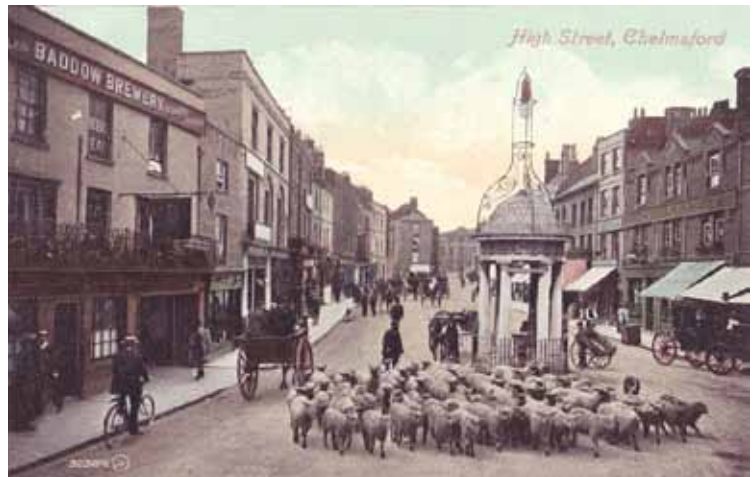
Chelmsford High Street

Along the routes you will discover evidence of how different countries have shaped our towns and cities.