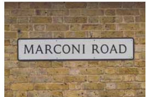
Scenes from around Chelmsford